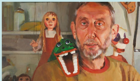
Michael Rosen by Lee Feather, oil on linen, 2011.